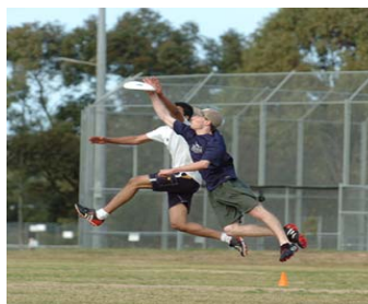
Action at Youth Nationals 2007

It is essential that you let your parents see this so they know what is happening and can also ask any questions that they may have.